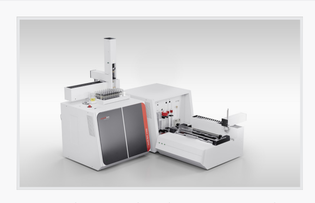
Figure 3: multi N/C 2300 duo with HT 1300, FPG 48 and AS 60 autosampler

The multi N/C duo systems are very well suited to analyze agricultural soil samples or related matrices like sediments or dried manure/ sludge samples according to the direct method of TOC determination described in EN 15936. Soils or sediments are predominantly homogeneous sample matrices, so that sample weights in a range between 100 mg up to 300 mg are sufficient to achieve precise and reproducible results. Higher sample weights of up to 3 g are possible to apply what is beneficial in case of inhomogeneous samples or very low carbon concentrations. Manual sample preparation (acidifying and drying) is recommended to do in batch, so that preparation time is reduced to a minimum. Sample analysis is fully automated, the dried samples just need to be placed onto the sampler FPG 48 and a sequence of up to 48 samples can be started. Simple calibration routines and the included wide range NDIR detector enable a broad measuring range of up to 500 mg C absolute for all multi N/C duo systems. This makes repeated analysis for samples with unexpected high concentrations unnecessary.