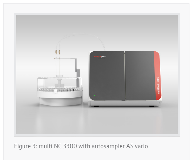
Figure 3: multi NC 3300 with autosampler AS vario

Real wastewater samples taken from the sewage treatment process also show excellent reproducibility. A fully