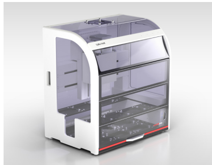
CyBio FeliX platform for liquid handling and automated nucleic acid extraction