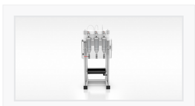
Figure 2: AFU 3 sample preparation unit

The measurements carried out show that sample preparation using the batch method by means of AFU 3 provides reliable AOX results for various types of challenging wastewater samples. Even samples with complex matrices or higher particle load can be prepared and analyzed quickly and reliably after appropriate dilution and enrichment on activated carbon. With the automatic filtration unit AFU 3, up to three samples can be transferred simultaneously into quartz containers. The multi X 2500 AOX analyzer features robust detection and simple automation and is ideally suited for AOX determination in wastewater samples.