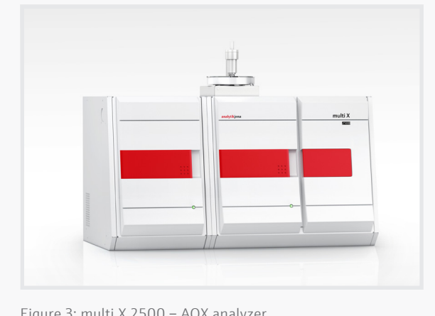
Figure 3: multi X 2500 - AOX analyzer