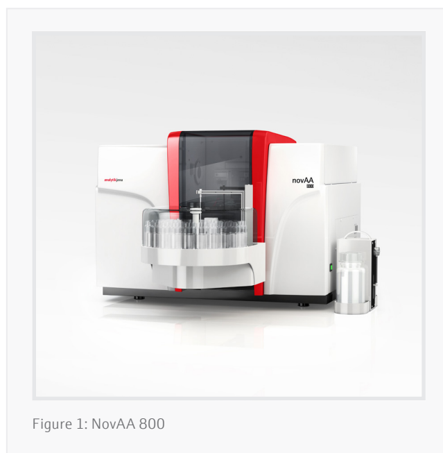
Figure 1: NovAA 800

The SFS 6.0 injection switch with continuous rinsing function and segmented sample injection ensures reduced carryover in case of high salt and matrix content while the automatic cleaning of the burner head using the Scraper provides stable analysis conditions for highly reproducible results. Using the autosampler with integrated dilution function enables a high sample throughput even for high matrix samples.